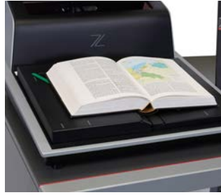
■ Book cradle OS 15000 Comfort