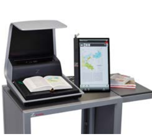
■ OS 15000 Comfort with touch panel and zeta Software