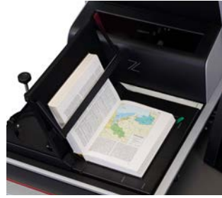
■ OS 15000 Comfort with book holder