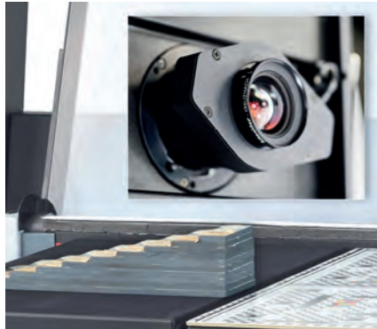
High depth of focus - electronically adjustable aperture