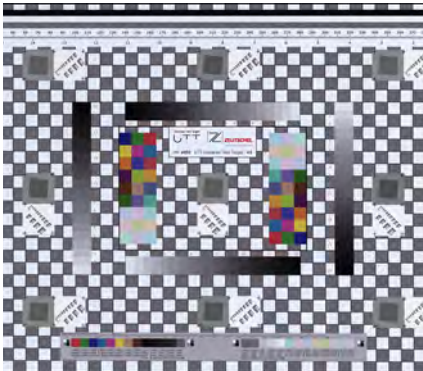
Fulfills ISO 19264-1 Level A, Metamorfoze Full and FADGI 4 Star