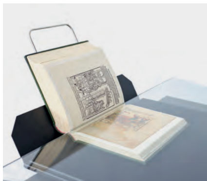
Various book holders optionally available