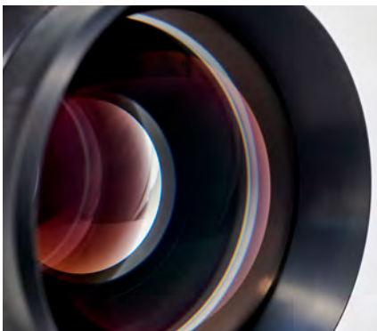
Perfect interplay between high-quality technical components