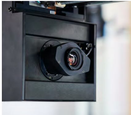
Camera system based on a CMOS sensor